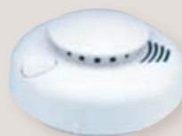
Wireless Smoke Detector