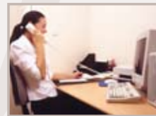
Unifone Telephone System

The Hills Home Hub delivers and distributes data, phone, video, audio and TV signals using the latest in data and TV cables from a centrally located enclosure to specially configured wall outlets in any room of the house.