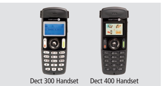
Dect 300 Handset Dect 400 Handset

Employees can use these phones to access the full range of communications services, including call-by-name, call transfer, conference calls, supervision, voice mail and notifications.