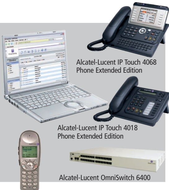
Alcatel-Lucent IP Touch 4068 Phone Extended Edition

When your company is ready to offer more advanced customer services and enhance its business processes, IP telephony is the answer. And it's much simpler than you might think. Alcatel-Lucent's traditional business telephony services can communicate fully with the IP and Internet worlds, so migration is smooth and cost-effective. You only use IP when and where you need it.